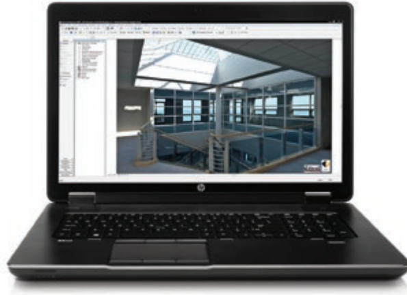
HP ZBook 17 Mobile Workstation

Inspire creativity with the incredible expandability of HP's most powerful mobile workstation.